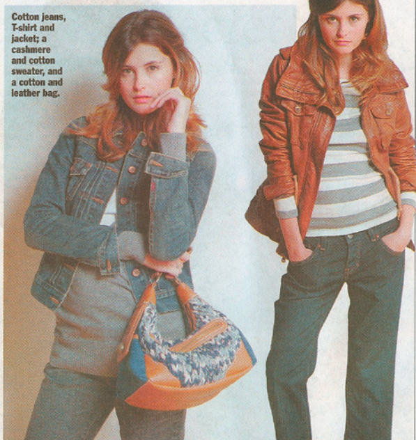
Cotton jeans, T-shirt and jacket; a cashmere and cotton sweater, and a cotton and leather bag.

NEW YORK — Gap is playing up its traditional strengths for fall. Under the leadership of a new design team headed by Charlotte Neuville, the firm is reviving its collection of classic T-shirts and jeans. In that vein, jeans and Ts are offered in all washes and styles, and the in-store visual merchandising will mirror the creative effort. Also included in the lineup are washed leather jackets, cashmere tunics, vests and cardigans.