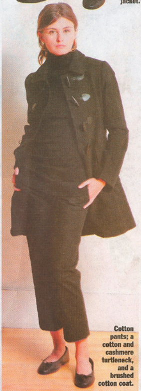
Cotton pants; a cotton and cashmere turtleneck, and a brushed cotton coat.