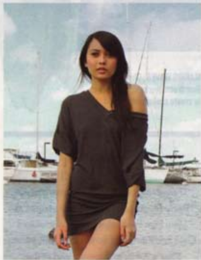
THE EEL WORLD: Fighting Eel's sexy, feminine designs make it a staple in every Hawai'i-hottie's wardrobe.