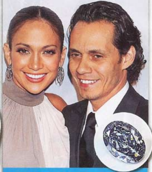
Aww! Marc Anthony gave J.Lo a 14.5-carat blue-diamond ring for their first wedding anniversary.