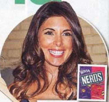
Jamie-Lynn Sigler eats a pack of Nerds on her birthday every year.

59% of women go clothes shopping at least once a month, while only 39% of men do.