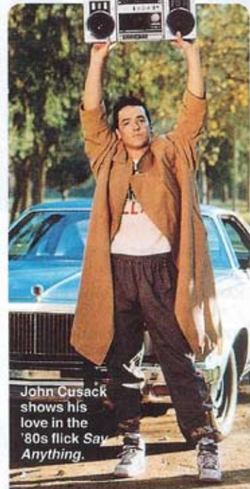
John Cusack shows his love in the '80s flick Say Anything .

More couples have tied the knot in July than in any other month over the past three years.